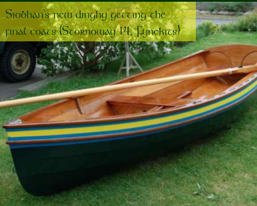
Siobhan's new dinghy getting the final coats (Stornoway 14, Fynekits)