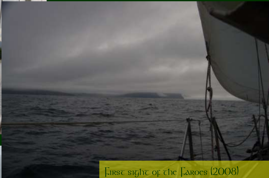
First sight of the Faroes (2008)