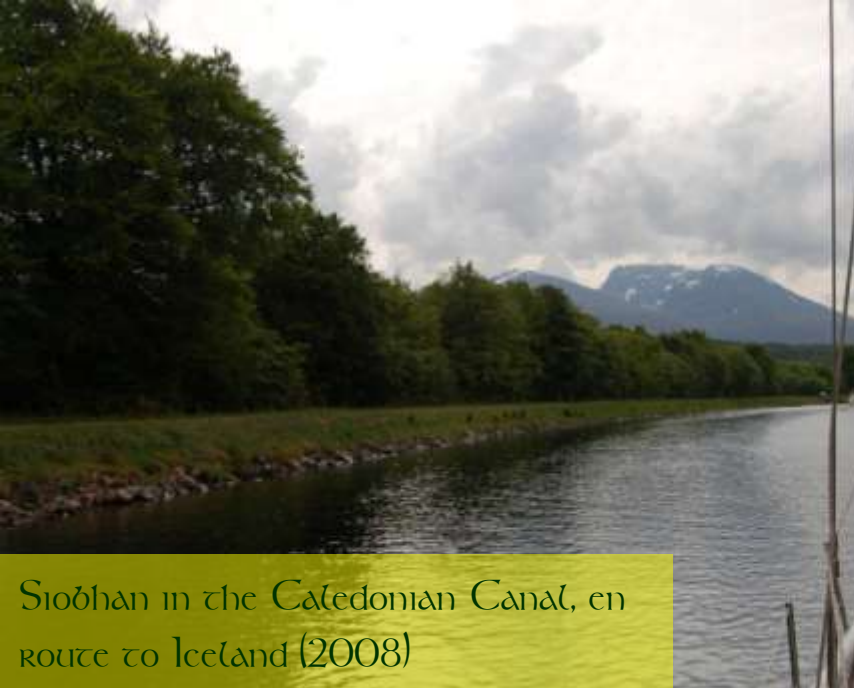
Siobhan in the Caledonian Canal, en route to Iceland (2008)