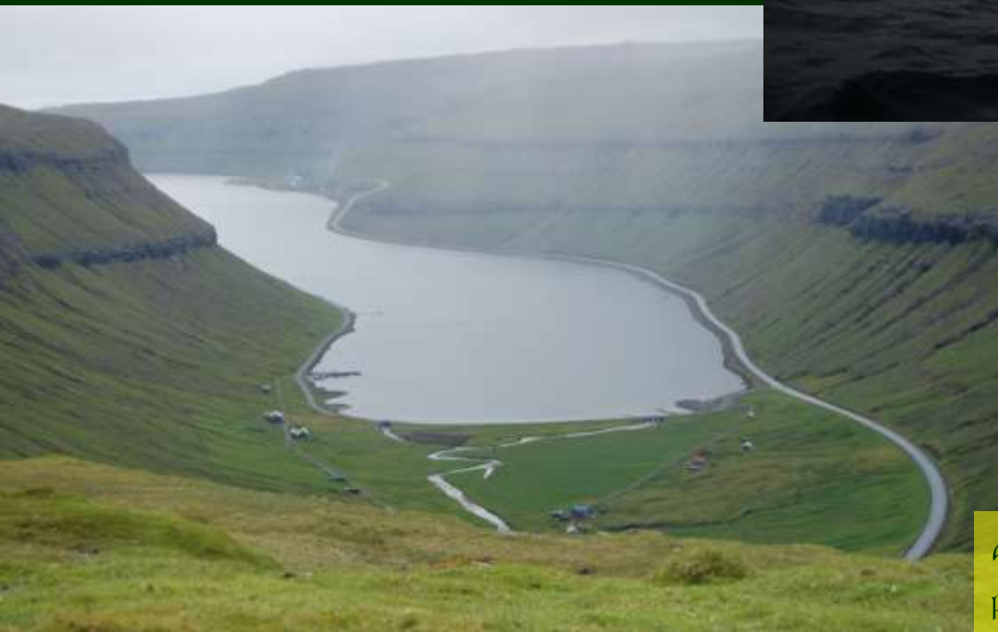
A typical Faroes day, not many trees for shelter... (2008)