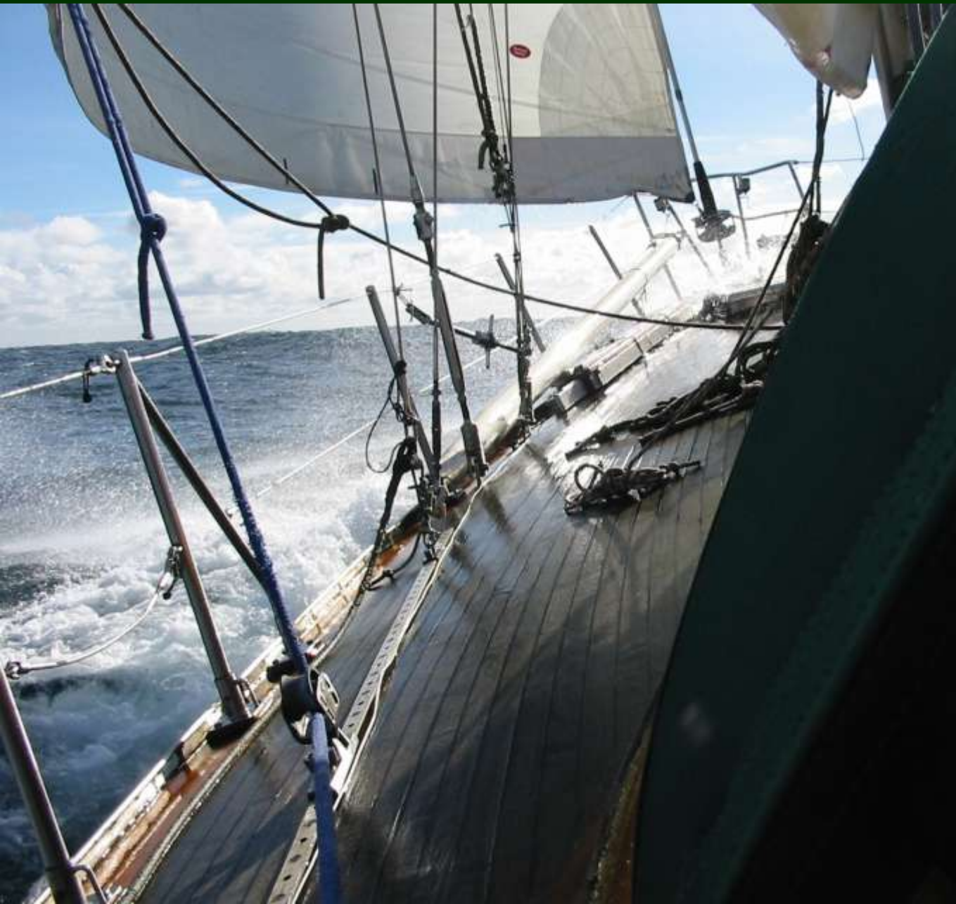
Siobhan once again putting smiles on faces... (2012 Scotland to NL)