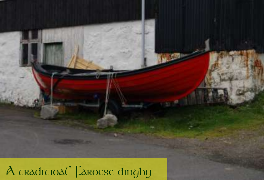
A traditional Faroese dinghy

Setting off from the Faroes to Iceland, in the calm start of a short weatherwindow